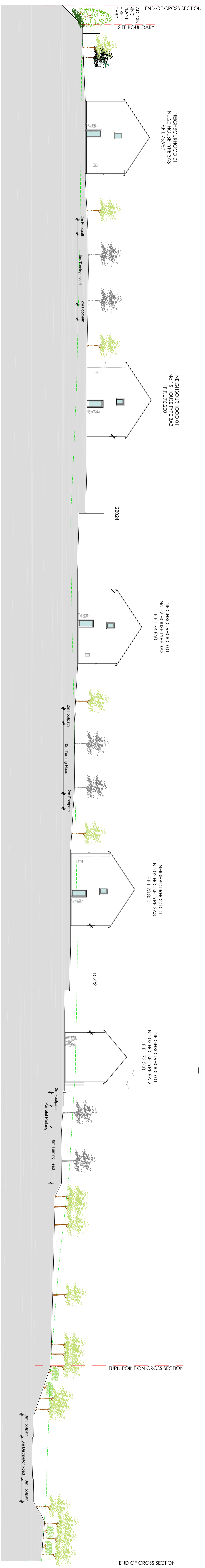
Section 1-1 SCALE: 1:500 @ A4